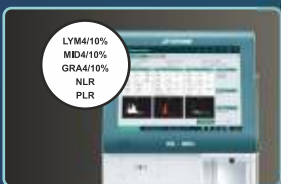
Offering NLR, PLR