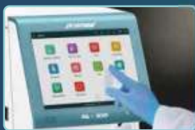
Intuitive operating system