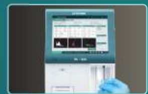
Small sample volume